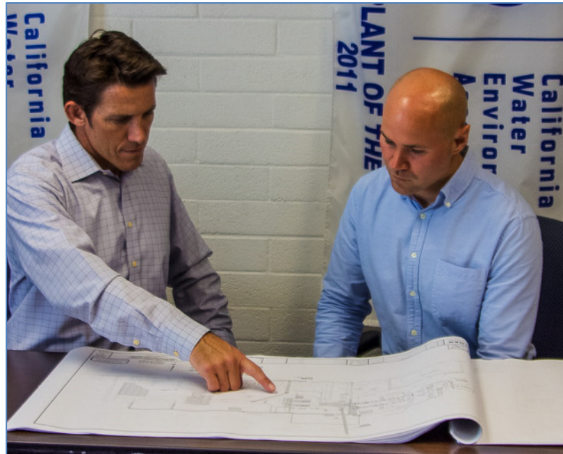
Capital project planning