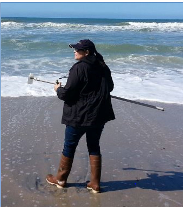
Ocean Shore Sampling