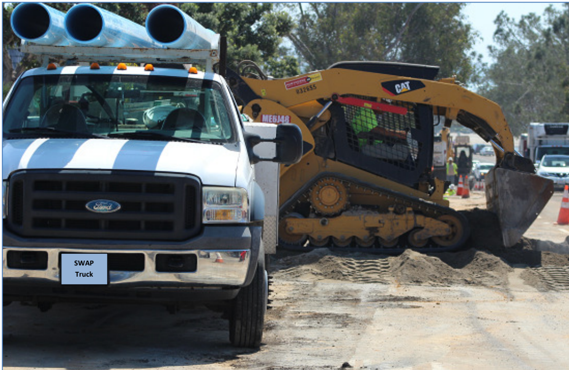
The City of Del Mar's Sewer, Water, Arterial, Paving ("SWAP") Project