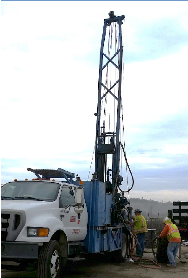
Geotechnical sampling for land outfall replacement