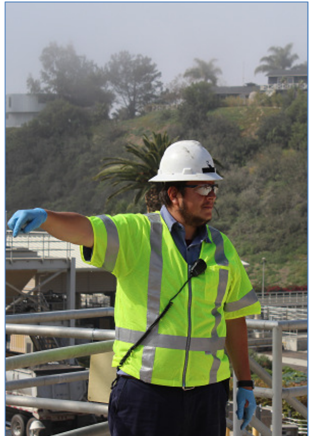
Crane Safety Supervision