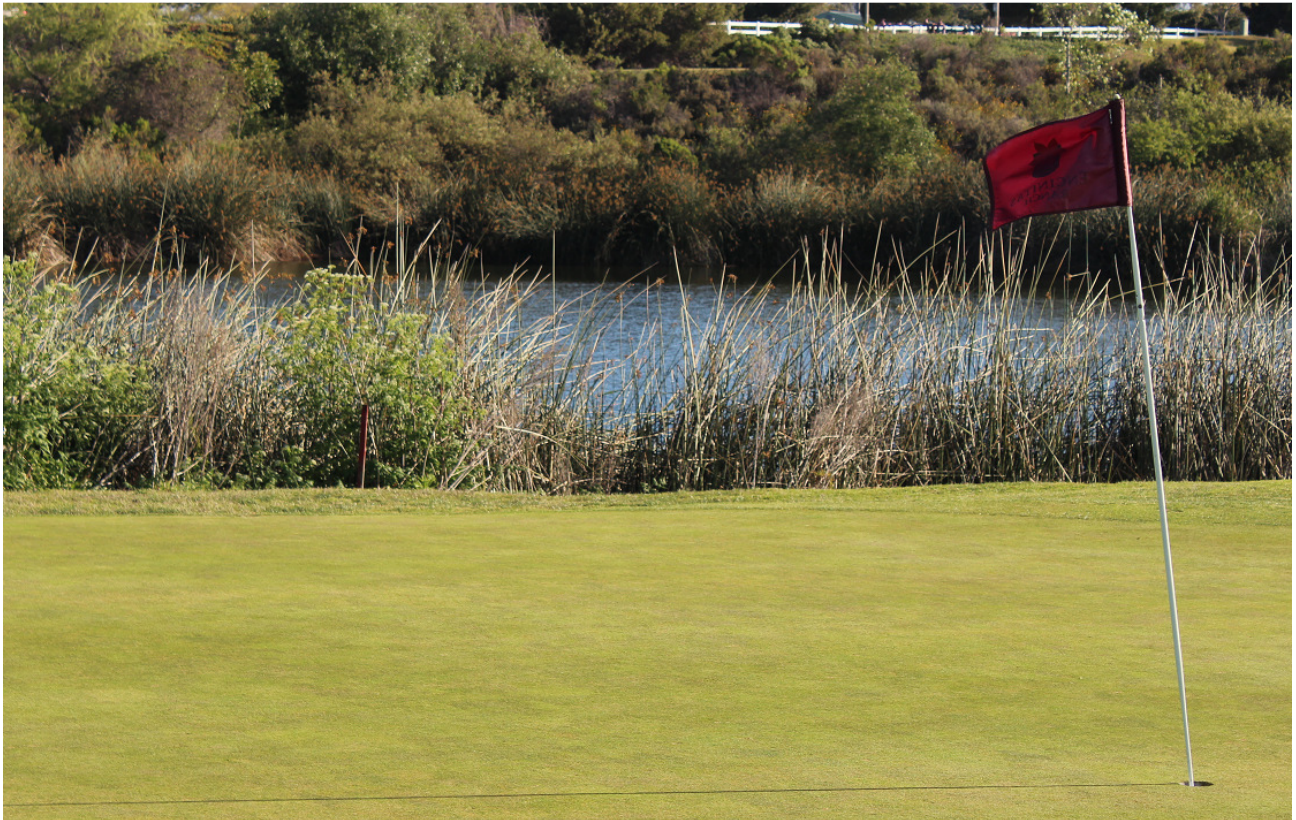
Encinitas Ranch Golf Course, Par 3, Hole #17 Reservoir filled with San Elijo Joint Powers Authority's Recycled Water